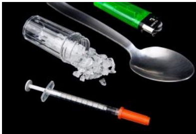
Figure 1 Example of methamphetamine and paraphernalia

An incident not related to drug task force activity in western Redwood County resulted in the seizure of approximately 226 grams of marijuana and 4.5 grams of methamphetamine.