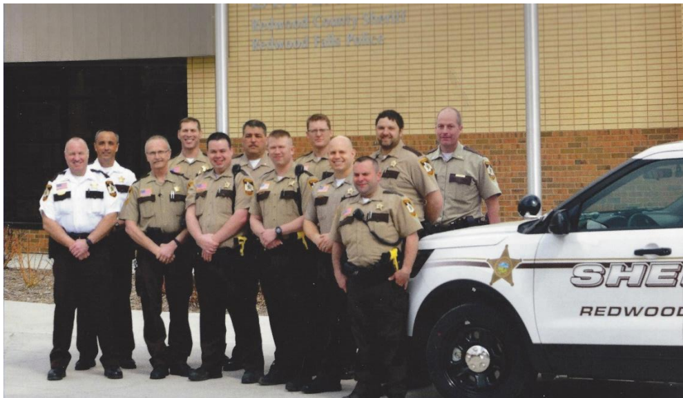
2016 Redwood County Sheriff's Office (Sworn Personnel)

This report is not all inclusive but rather a summary of the Redwood County Sheriff's Office community involvement and enforcement activity.