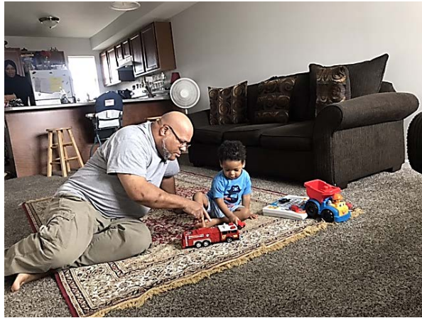
Rose Hill Family