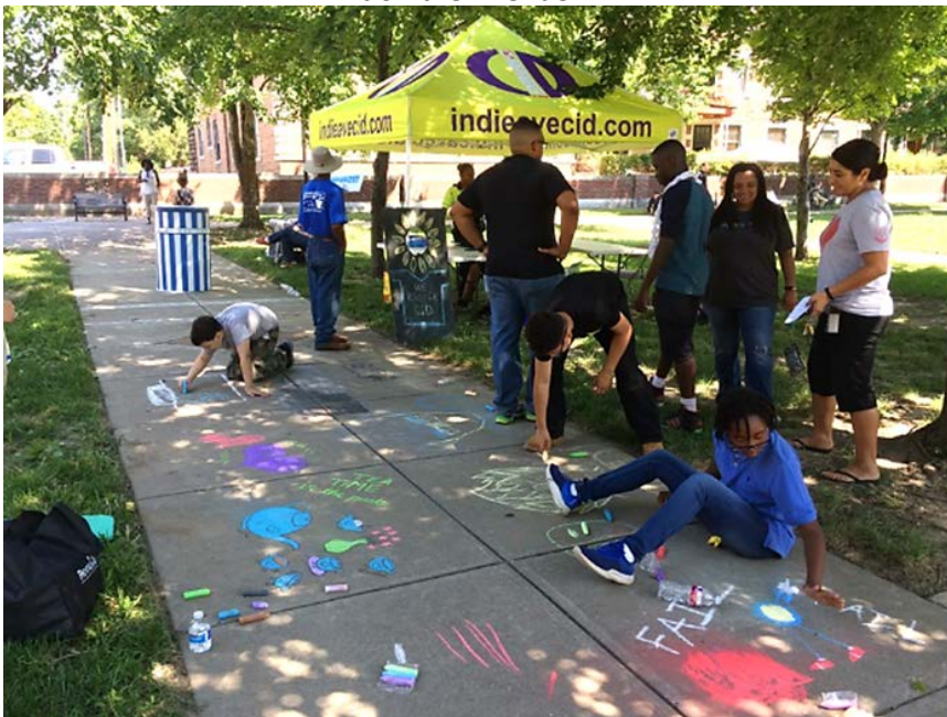
Art on the Avenue