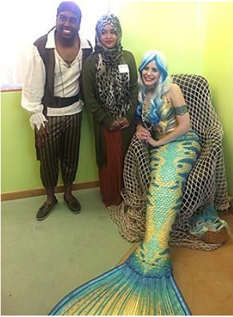
Family Fun Night