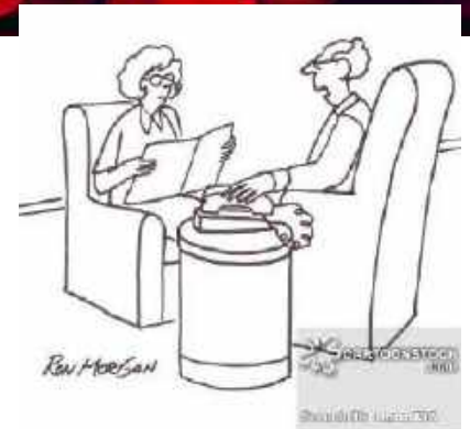
"The grandchildren said they Googled us. I didn't feel anything, did you?"