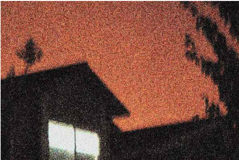
SCARY SCARY NIGHT / COFFEE PARK in SANTA ROSA, CALIFORNIA, IS BURNING / OCTOBER 9TH 2017 / 3 AM

I pretty much talk with everybody I meet; in the streets, shops, elevators, planes, trains and wherever I travel (yes, especially in Denmark – a tougher challenge). 99.9% of the time I'm met with positive responses, smiles and comments. These moments are precious to me because they prove that we do want to connect, that we do care about each other and no matter the means of communication, we do acknowledge that we are all here together on this globe thing – and isn't that nice? Yes I know, this is the BIGGER picture; but most of the time we forget what it looks like because we are so darn busy getting to the supermarket. Once in a while stop, take a deep breath, smile and communicate; we all do mean something to each other, if you agree or not. When we take the time to acknowledge that, we will always be rewarded accordingly – and for the most with big smiles.