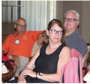
Members look on as the shenanigans continue.