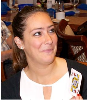
The 50/50 Now $500