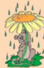
April Showers Bring May Flowers

Though April showers may come your way, They bring the flowers that bloom in May. So if it's raining, have no regrets, Because it isn't raining rain, you know, (It's raining violets,) And where you see clouds upon the hills, You soon will see crowds of daffodils, So keep on looking for a blue bird, And list'ning for his song, Whenever April showers come along.