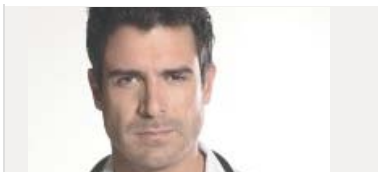
How to find Dr. Right