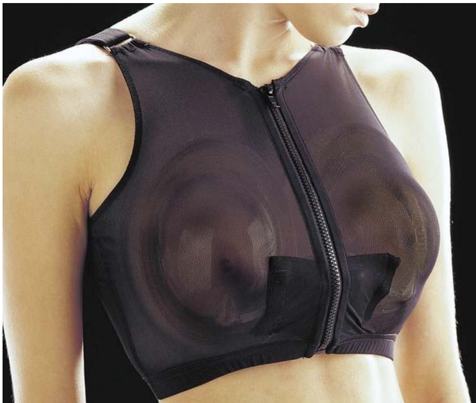
The special suction-pump bra device used to expand the breasts prior to breast augmentation or reconstruction surgery. (Brava, courtesy / November 8, 2011)

Comments 8 Share 76 +1 0 Tweet 4 Recommend Confirm