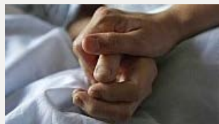
The top causes of death in Florida in the last 10 years