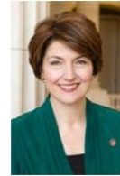
Cathy McMorris Rodgers