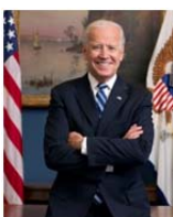
Joseph R. Biden, Jr.