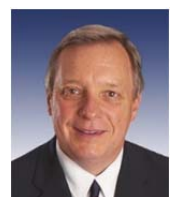
Richard J. Durbin