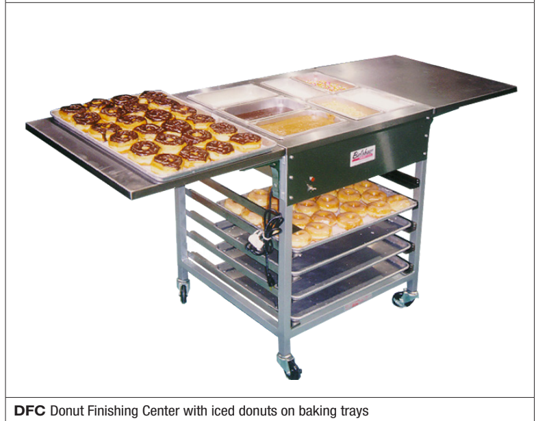
DFC Donut Finishing Center with iced donuts on baking trays