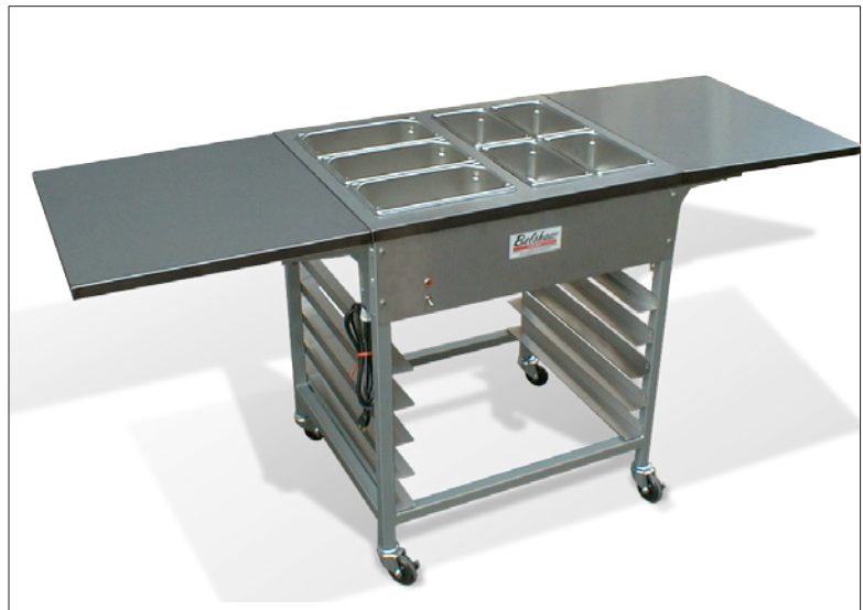
DFC Donut Finishing Center