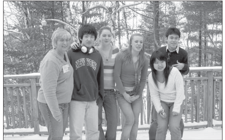
The WNF&GA, Michigan Division, has launched a campaign to raise $30,000 to create a new endowment to support a variety of 4-H programs, including 4-H international programs. Above are exchange students from the Japanese LABO and the Ukraine and Russian Future Leader Exchange (FLEX) programs at Kettunen Center for the 4-H Citizenship, Leadership and Service workshop in January.

The Michigan Division of WNF&GA is continuing its support in a campaign to raise $30,000 by 2009 to create the Woman's National Farm and Garden Asso-