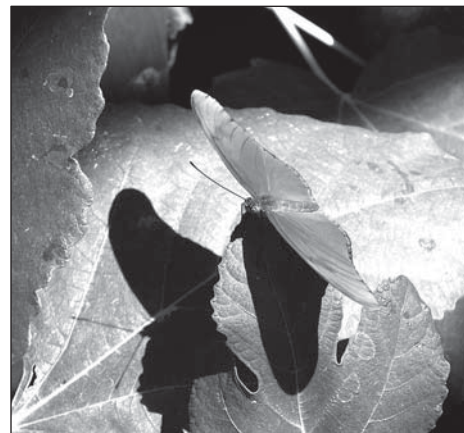
Monarch, Julia and zebra butterflies will be on display in the Indoor 4-H Children's Gardens during the annual Butterflies in the Garden exhibit March 1 to April 27.

Visit http://www.mi4hfdtn.org for the complete schedule with event descriptions and details.