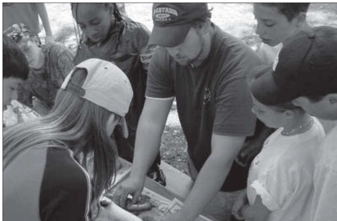
Corporate gifts from Dow Chemical Company, DTE Energy Foundation and Pfizer are funding innovative 4-H environmental and outdoor education programs.

DTE Energy Foundation's partnership with 4-H Youth Development connects to their commitment to community support in education and the environment and development and diversity, which with