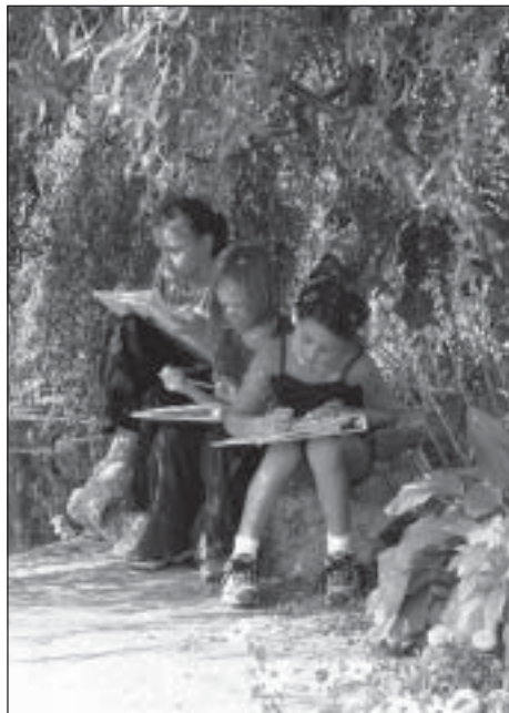
The 4-H Children's Garden summer season is filled with fun family learning opportunities such as Stories in the Garden, Garden Chefs and Kid Curator programs.

The outdoor garden is open daily from dawn to dusk until Oct. 31. Admission is free,