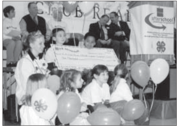
Lapeer County's Irwin 4-H Club Read received a $10,000 grant from the J.C. Penney Afterschool Fund. Lapeer County will use the grant for books, supplies, digital and disposable cameras, field trips, volunteer training, staffing and program expansion.