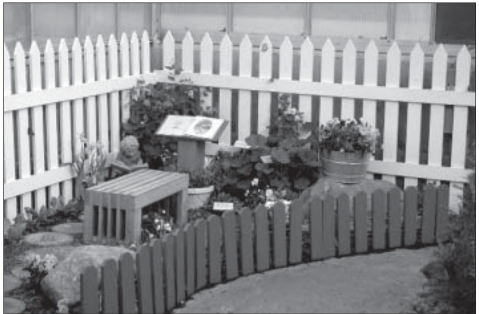
The indoor 4-H Children’s Garden opened May 2 to offer year-round youth horticulture learning opportunities. The garden features short-term exhibits such as the butterfly garden and the “Take A Deep Breath” theme area, pictured above.