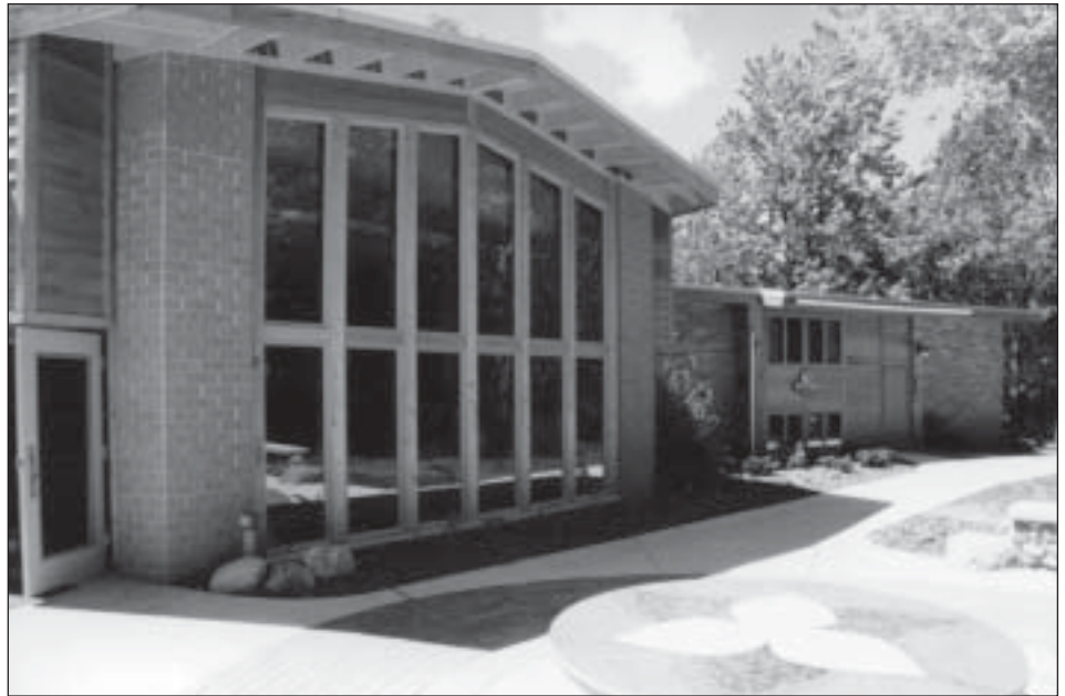
Another good way to support 4-H is by considering Kettunen Center as a site to conduct a multiday retreat, conference, reunion or gathering.

Kettunen Center has hosted association conferences, church retreats and large youth conferences conducted by other organizations, and it has been a popular training site for several state agencies.