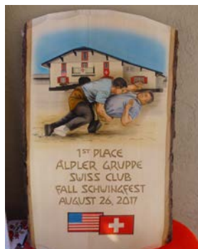
Memories of Schwingfest 2017!

https://www.facebook.com/groups/luttesuisse/