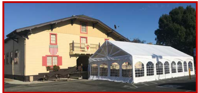
Swiss Park Hall with Outdoor dining tent

7. Tickets, unknown date, Refreshments 10 cents; Refreshments 30cents - Patrons paid for drinks with tickets at the dances. There was also a "uniformed guard" at the dances.