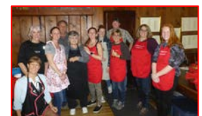
Fondue and Jass 2020 Good memories!

As part of our goal to reach out to our membership, to connect with each other and to update our member information we would also like to have a column in our newsletter that recognizes our member's birthdays by month. Could you please send Aelpler Gruppe your birthday including, month / day / year. We will not share this information except for the month when we note it in our newsletter. Please send this information to aelplergruppe@gmail.com . We look forward to seeing you when our events begin again, hopefully in the very near future.