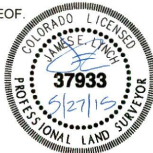
EXHIBIT ATTACHED AND MADE A PART HEREOF.