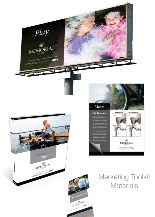
Marketing Toolkit Materials

PROUDLY DESIGNATED AS A CENTER FOR AdvancedRecovery™