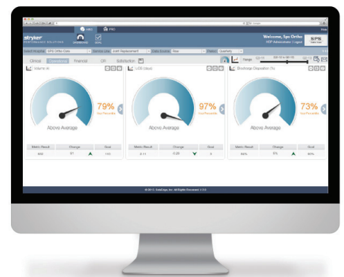
Hospital Reported Data

To learn more about becoming a CARE designated facility, contact us: 1.800.616.1406 | spsinfo@stryker.com