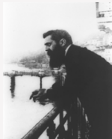
Iconic Photo of Herzl on the famous hotel balcony in Zurich