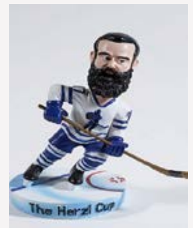
The HERZL cup