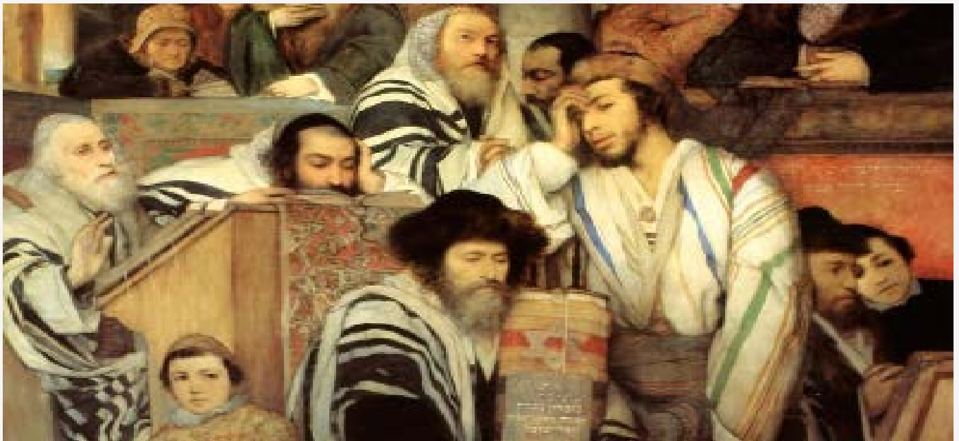
Yom Kippur Services - From a famous painting by Maurycy Gottlieb, Polish Jewish realist painter