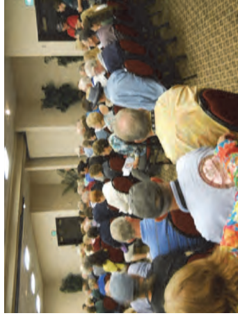
Judge's "instructions meeting" at the National Show in 2012. Expect the teams to vary in approach.

The DSO has a long tradition of team judging based on a discussion of the attributes of the entries in the classes judged. Even though that is the approach recommended by the ADS, you may find judging teams (at the upcoming National Show in Michigan, for example) where the team leader discourages discussion. If you find yourself in that situation, I encourage you to persevere. A key benefit in judging with judges from outside our own club is to learn how they approach the judging process. So, ask away! Provide your observations politely and respectfully and listen carefully and respectfully to the other team members.