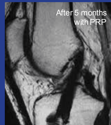
After 5 months with PRP

A more homogeneous signal was demonstrated in grafts with PRP, which suggests a quicker maturation rate. 4)