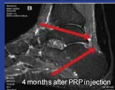
4 months after PRP injection

Achilles MRI before and after PRP treatment. (A) MRI before PRP injection, partial Achilles tendon tear. (B) MRI 4 month after PRP, healing of partial tear. 4)