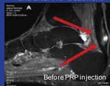
Before PRP injection