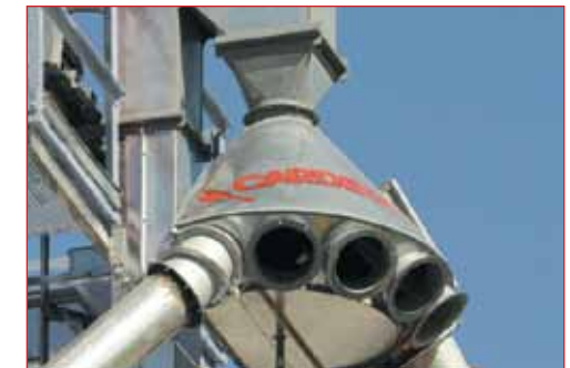
Grate in discharge to help prevent plugged distributors and spouts.