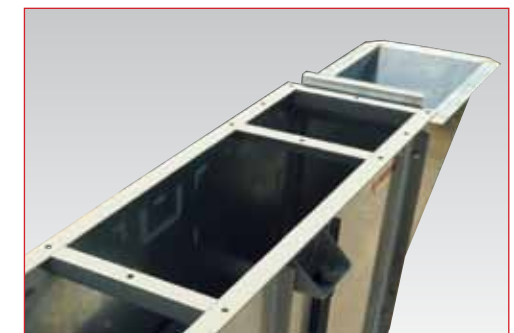
Modular inlet hopper can be installed on either side in 2 different heights for easy system installation.