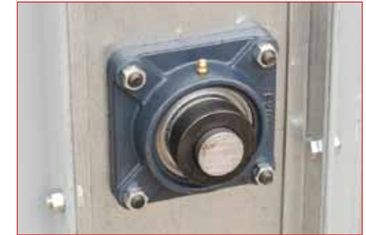
Serviceable self aligning bearings on all shafts.