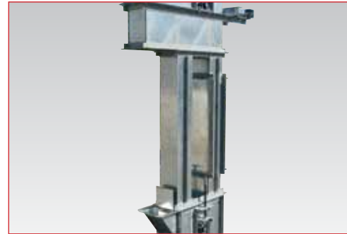
Mechanically fastened and sealed leg sections.