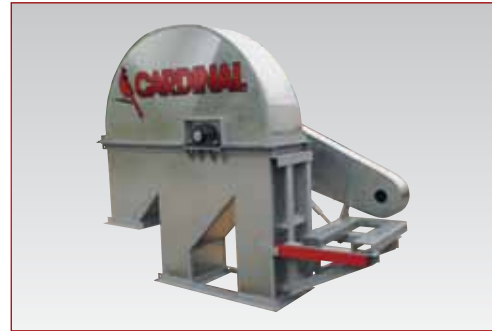
All galvanized steel sheet construction.