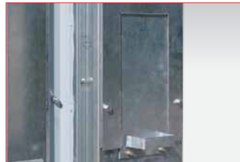
Sliding access doors at ground level to service cups & belt.