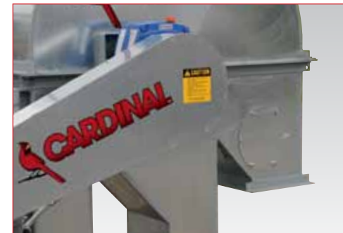
Inspection door at discharge port.