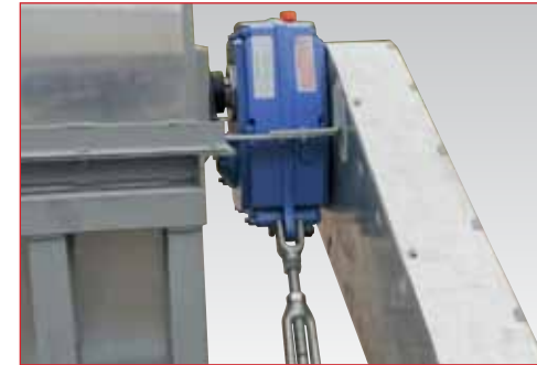
Precision gear reduction drive units.