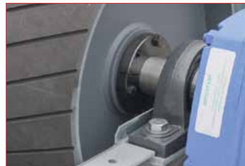
Taper lock double hubs on drive pulley for positive drive.