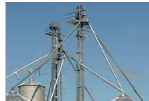
Leg sections welded in precision jigs to ensure easy assembly.