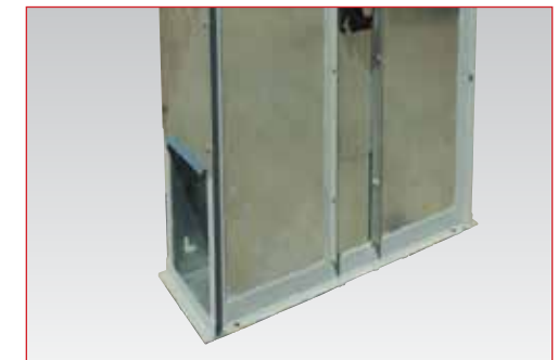
Boot cleanout is easy through hand slide outs on both sides.