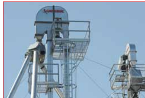
Hot dip Galvanized structural steel service platforms. OSHA approved cages and ladders for safe maintenance of head systems.