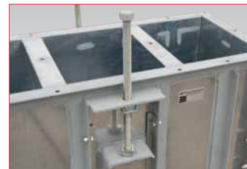
Easy access belt tensioners on ground level.