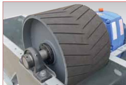
Rugged non slip Neoprene head lagging on drive pulley enhances the long life of our Heavy Duty PVC belting.