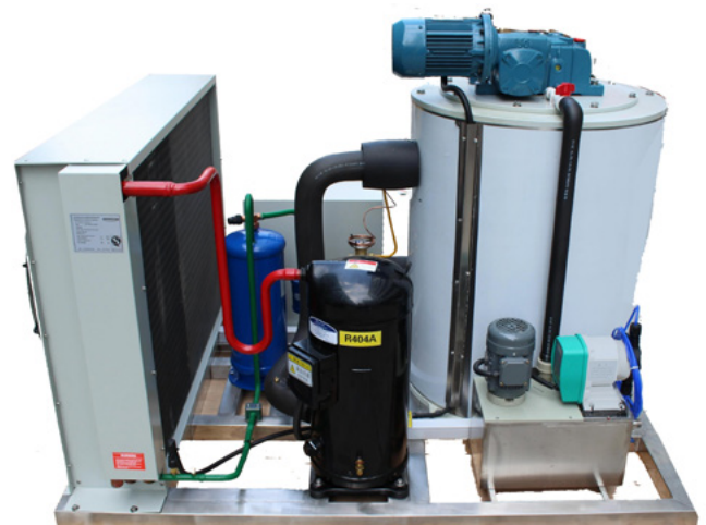
Bucceri Ice flake Generator- Single Unit