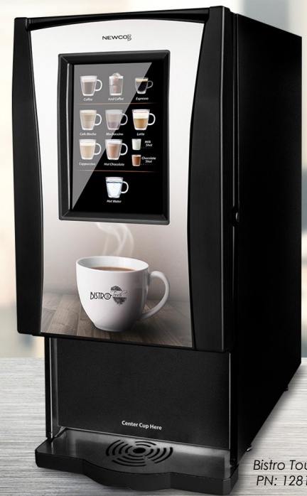
Bistro Touch PN: 128110