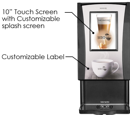
Brandable Splash Screen Standard Drink Option Screen