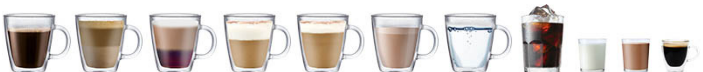
Coffee Cafe Mocha Mochaccino Latte Cappuccino Hot Coco Hot Water Iced Coffee Milk Shots Espresso

The engaging and intuitive touch screen allows consumers to easily choose a beverage and customize the size and strength of each drink. Allows up to 3 drink sizes (6oz to 20oz) and strengths (mild, regular and bold) to be visible on the screen to the consumer. Bistro Touch also allows drink sizes and strengths to be disabled in programming for locations that want to serve only one cup size or a specific strength.