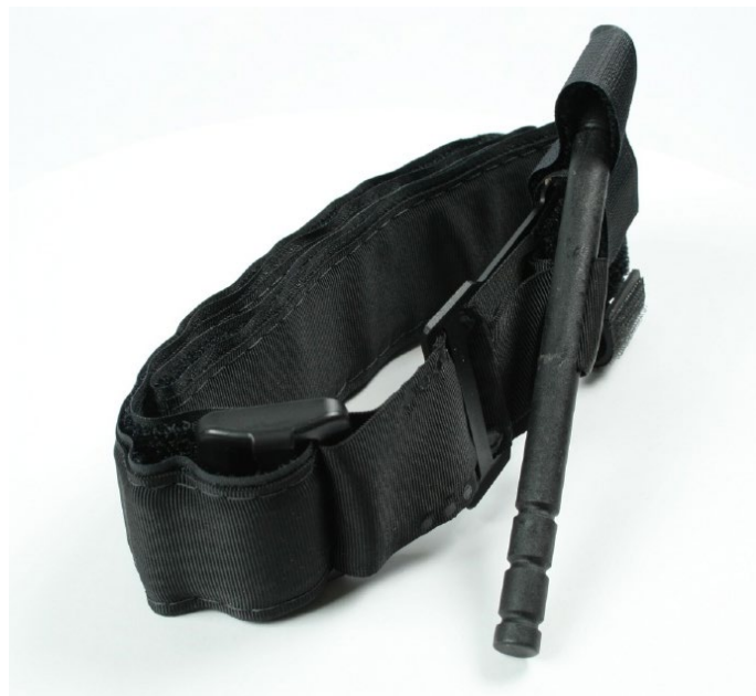
Figure 1: Combat Application Tourniquet