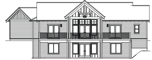
REAR ELEVATION Shown in Timber

Deck not included in the base price of home.