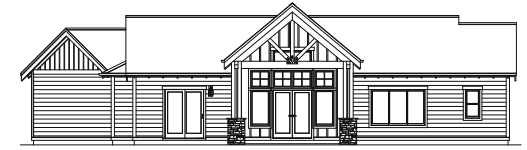
REAR ELEVATION Shown in Timber

You enter this home through a spacious entry with high vaulted ceilings that continue into the living room and rear porch cover. With options to build a 1715, 1858 or 2919 square foot home, the Aspen is laid out efficiently and makes good use of any sized lot. The large master bathroom features his and hers sinks, and a large walk-in closet. The kitchen opens into the dining space and has views of your property's side yard. The Aspen offers you the option for a three-car garage, providing ample space for storage and hobbies.