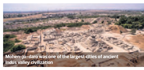
Mohenjo-daro was one of the largest cities of ancient Indus valley civilization

coastal line, food streets, world class infrastructures, waterfalls and theme parks for entertainment of all ages, serene picnic places and most importantly, historical civilizational heritage. It is most famous for being home to the ancient city Moenjodaro (Indus Valley Civilization). Type online 'Attractions of Sindh' to explore what meets your appetite.