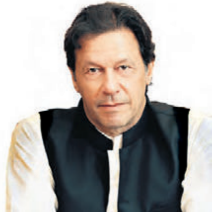
Mr. Imran Khan Prime Minister of Pakistan