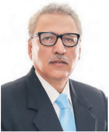
Dr. Arif Alvi President of Pakistan