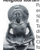
Fasting Buddha is a mesmerising masterpiece of Gandhara Art placed in Lahore Museum

Religious Tourism Pakistan is also a land of spiritual endowment, a resting place of many spiritual saints from all religions, be it the sufi mystics of Islam, Hindu Tiraths dating back to 3000 BC, the disciples of Buddha attaining "nirvana" buried under the remains of Gandhara Civilization and Baba Guru Nanak Ji, the founder of the Sikh religion was born in 1469 AD at Nankana Sahib, about 72 km north of Lahore in Pakistan. All Gurdwaras and Sikh shrines in Pakistan are declared sacred places and are meticulously maintained by the Government of Pakistan.