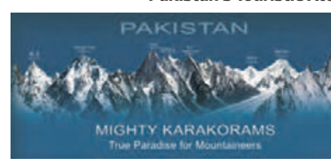
PAKISTAN MIGHTY KARAKORAMS True Paradise for Mountaineers

Pakistan is a land blessed with abundance of nature's beauty and a 'Cradle of Ancient Civilizations' and a 'Melting Pot' of multiple religions & cultures, which has enriched the country with vast historical heritage, offering a treasure of knowledge for archaeologists, historians, teachers of history-arts-culture, physical manifestations of the belief of religious pilgrims, sightseers' paradise, and adventure loving people. Skiing, Trekking, mountaineering, white-water rafting, mountain and desert jeep safaris, camel and yak safaris, trout fishing and bird watching are just a few of many activities which attract tourists to Pakistan. It is a land of splendors with the landscape stretching remarkably from the high mountain ranges in the northern areas to