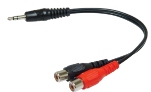
3.5mm to Two RCA Female