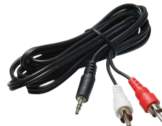
3.5mm to Two RCA Male (6ft.)