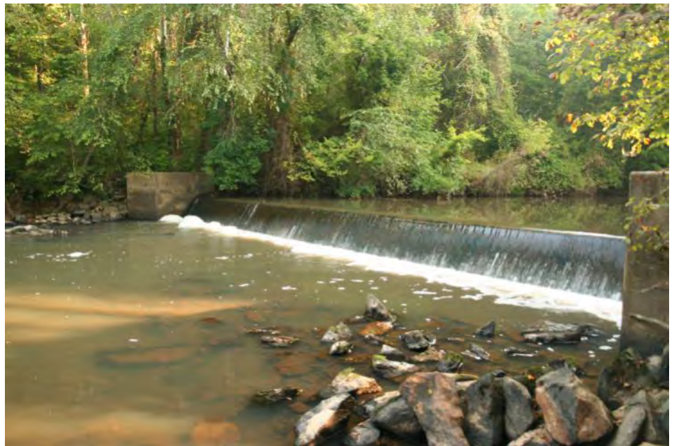
Low Dam at Brooks Bridge Paddle Access