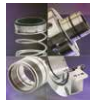
FLEX-A-SEAL MECHANICAL SEALS