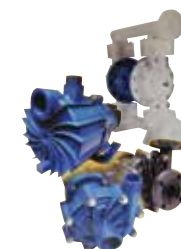
FINISH THOMPSON CENTRIFUGAL