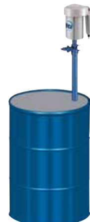
FINISH THOMPSON DRUM