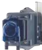
STENNER PERISTALTIC MEETING