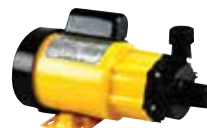
PAN WORLD CENTRIFUGAL