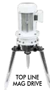
TOP LINE MAG DRIVE