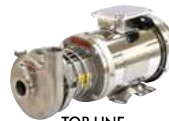
TOP LINE SANITARY