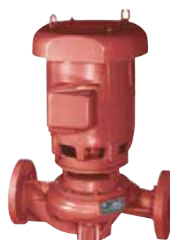
BELL & GOSSETT CENTRIFUGAL