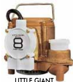
LITTLE GIANT SUBMERSIBLE