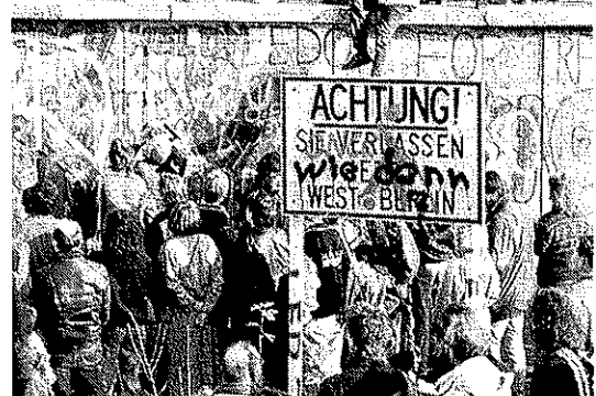
People protesting on the Berlin Wall in 1989