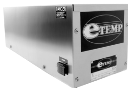
E-Temp CMA Booster Heater (40° and 70° rise) Only available in 3 phase with 70° rise Standard voltage 208-230V three phase Factory Installed Only