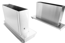
Vent Hoods 4" x 16" with Damper Control (2 per set)