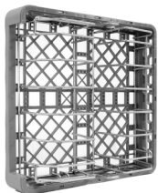
Sheet Pan Rack