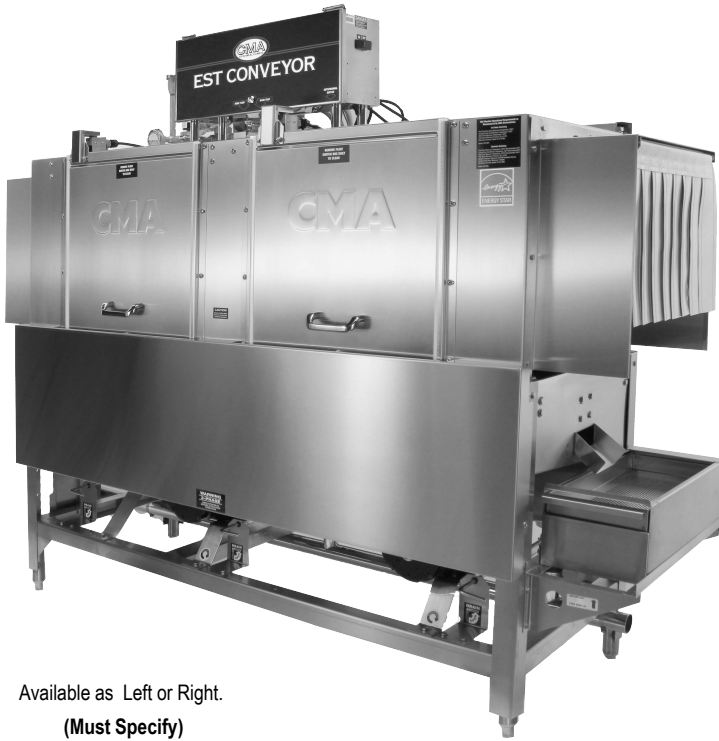
Available as Left or Right. (Must Specify)

High Temperature-Low Temperature 66" Conveyor Dishmachine