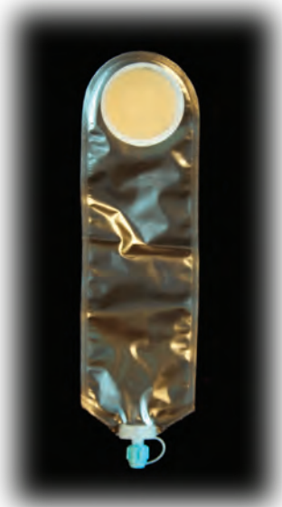
7OS2528S For double barrel surgery