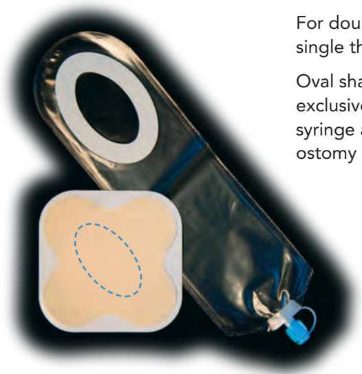
7OS2528S 3½" and 8" pouch 88 mm and 200 mm

For double barrel surgery with daisy shaped barrier and single thickness hydrocolloid.