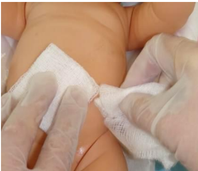
Carefully clean around stoma with lukewarm water

Make hole large enough so that barrier does not touch stoma