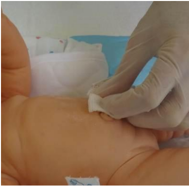
Put gauze over stoma to absorb any output