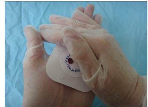
Warm the barrier for 2 minutes between hands before applying. USE NO OTHER HEAT SOURCE!