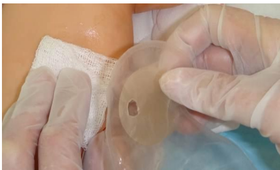
Remove paper from barrier and get ready to remove gauze to attach pouch