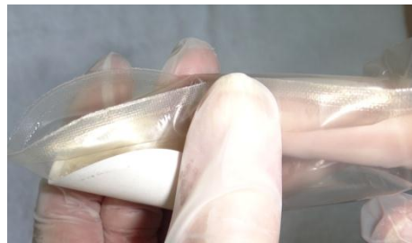
Pull pouch away from the barrier. Fold barrier to make it easier to cut