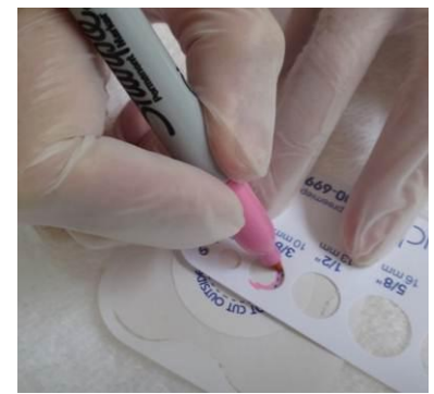
Transfer measurement to paper side of barrier/wafer