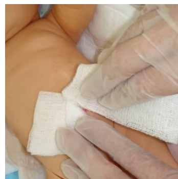
Pat skin dry and leave gauze in place to absorb any output