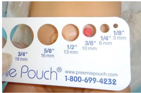
Without actually touching the stoma measure opening slightly larger than stoma