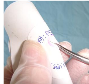
Use blunt curved scissors to cut hole in barrier

Make hole large enough so that barrier does not touch stoma