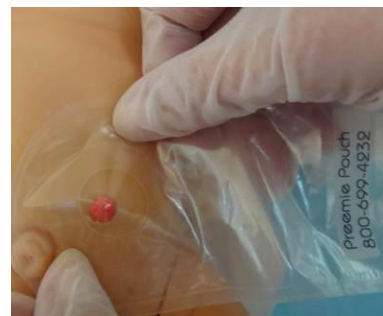
Center hole over protruding stoma, avoiding to cover belly button or groin

Remove any wrinkles and air bubbles under barrier.