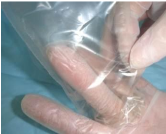
Insert finger into pouch