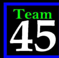
4 - 5 Year Olds