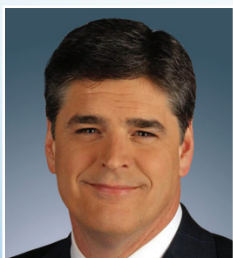
Sean Hannity M-F 3:00 pm - 6:00 pm