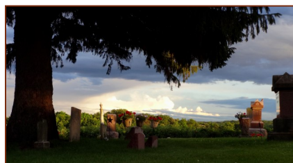
Valley Grove and Grace Cemetery Board, May 2014