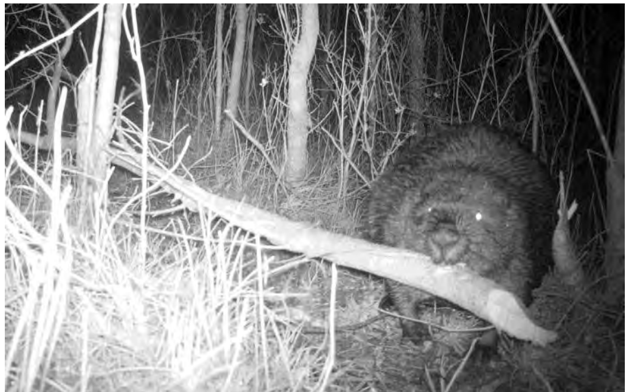
One of beavers cataloged in the Elon study