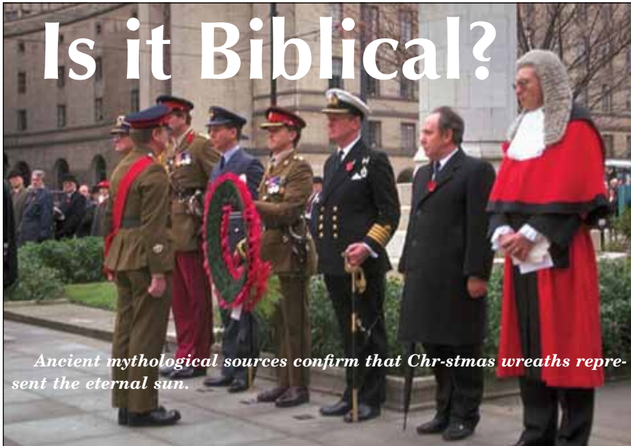
Ancient mythological sources confirm that Christmas wreaths represent the eternal sun.

The Golden Bough, Larousses's Encyclopedia of Mythology, and The Cross in Religion and Art.