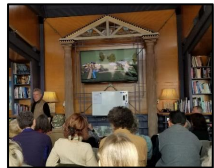
The Northwest Arkansas Permaculture Study Group at Rockspire