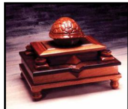
Box Turtle Box Designed and built by George Myers