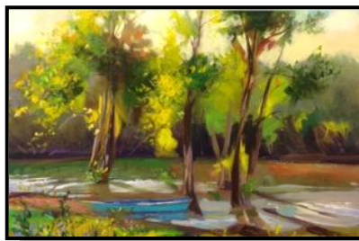
Table Rock Lake - Eureka Springs Oil on canvas by Paul O'Neill

In 2004 Paul retired as a graphic artist after a career spanning more than thirty years doing projects with several Fortune 500 Companies and began to dedicate himself to the fine art of painting. Paul's work is noticeably influenced by the American Plein Air Impressionists. The American Impressionists developed a style that evolved from French Impressionism but placed more emphasis on recognizable subjects. They espoused painting 'en plein air' (finishing their work on location) and depicting the changing effects of light with masses of color while modeling and defining the forms with distinct color variations. Their primary goal was to capture the light and colors peculiar to particular locales. Residing in New England, Florida and Arkansas has provided Paul with three locales from which to draw inspiration. The unique light and palette of each is deftly captured in his acrylics and oils.