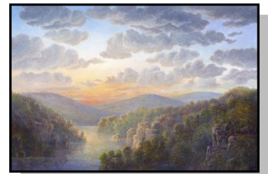
Sunset on the Kings River Oil on Canvas By Ernest Kilman

He compares his canoe to a time machine, providing an entry back into the old American landscapes. The canoe is an environmentally friendly way to take his materials deep into thickly wooded areas, to what he calls "the last beautiful spots." Sometimes he stays for a week at a time, drawing and painting every day. By living with the wilderness, looking at the subject matter, breathing the air, smelling the aromas, and hearing the bird songs, the whole natural environment goes through all of his senses and spill out through his brushes, painting scenes little different from how they might have looked to an explorer from long ago.