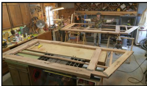
Rusty Rothgeb working on new MobbyMac Carriage House front doors at Rockspire shop.