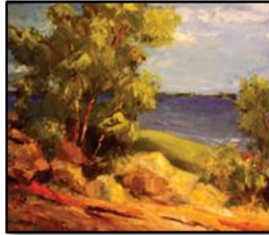
Landscape Oil on canvas circa 1990