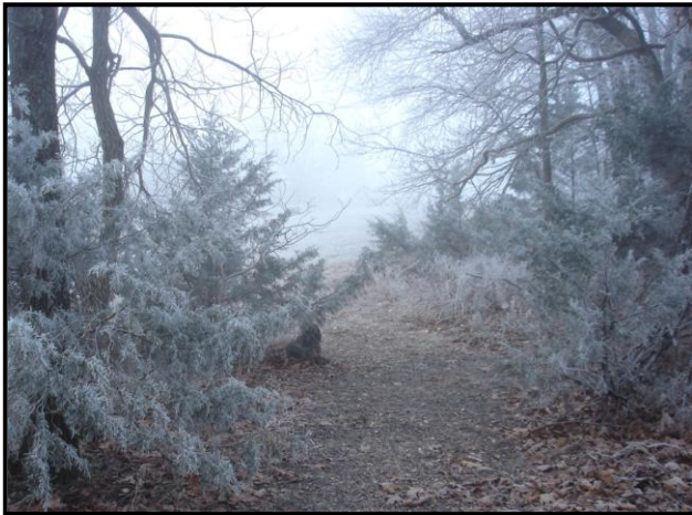
Hoar frost along the upper nature trail 12.18.11