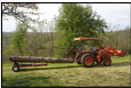
Log being hauled from the woods to the mill Photo by: G. Myers 4.6.12

A companion blog at www.rockspire.com is intended to create a virtual forum to help in the evolution of the Manifesto.