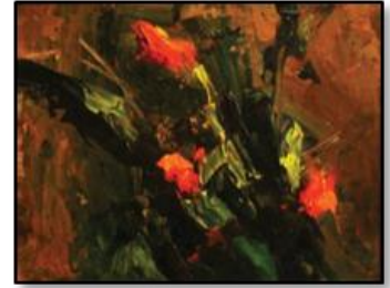
Abstract Oil on canvas circa 1995