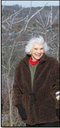
At Rockspire December 2006