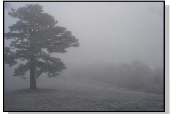
Hoar frost along the upper nature trail Photo by: G Myers: 12.18.12

J YNX AND GEORGE took their regular early morning walk on the upper nature trail and encountered hoar frost blanketing the valley and forest. Tiny crystals nestled in the ether, hushing all sounds. The atmospheric conditions were perfect that December morning for the phenomenon, leaving strange fluffy deposits on the vegetation. Their crystalline beauty was breathtaking and fleeting.