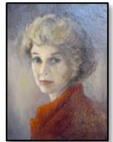
Self portrait Oil on canvas circa 1964

T HE ROCKSPIRE MANIFESTO, sets the vision for sustainable living " where material, physical, emotional, and spiritual needs are enhanced by guaranteeing the sustainability of life's basic needs of water, food, health, shelter and community. "