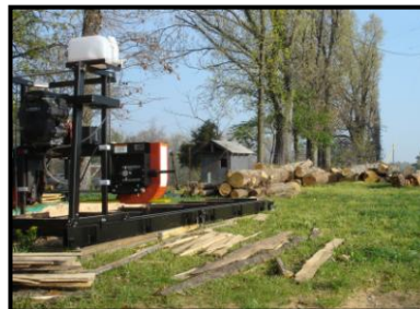
Logs waiting to be milled Photo by: G. Myers 4.7.12

In addition, The Rockspire Forum for Sustainable Living will sponsor group meetings at Rockspire to discuss sustainable lifestyle issues with invited authorities on related topics.