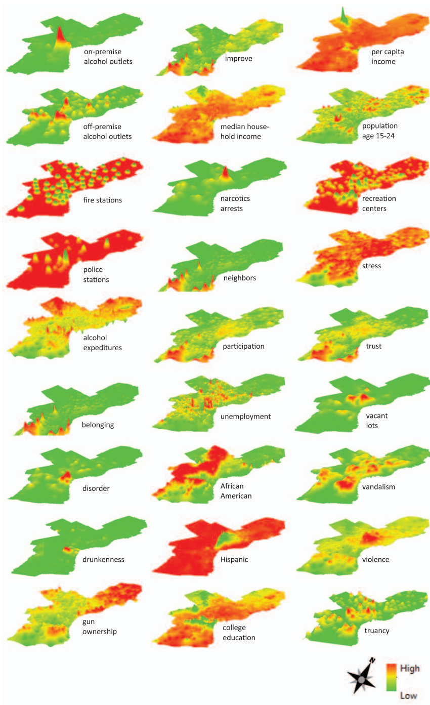
FIGURE 2. Raster surface layer of the 27 risk factors and protective factors across the urban landscape.

high household income, higher in areas with fire and police stations, and high levels of household gun ownership.