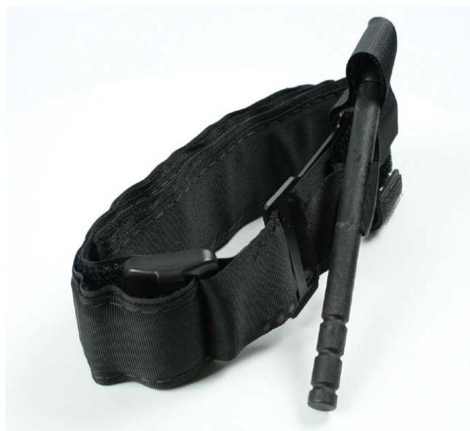
Figure 1: Combat Application Tourniquet