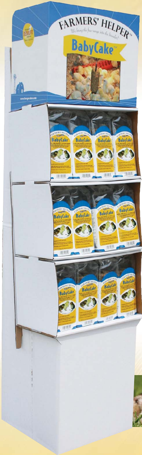
PP34 BabyCake™ Floor Display

"We bring free range into the brooder!"™