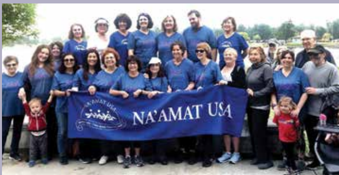
Members of the Western Area/San Fernando Council participated in a 5K Walk for NA'AMAT at Balboa Park in Encino, CA.