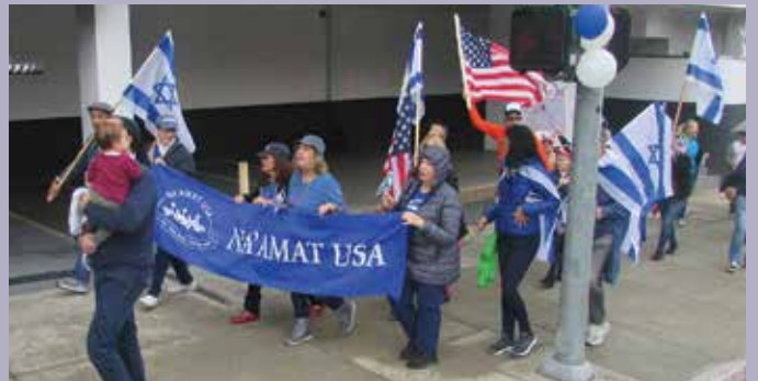
NA'AMAT marched in the rain to celebrate Israel's 71st birthday in Los Angeles. The event was sponsored by the Israeli American Council.