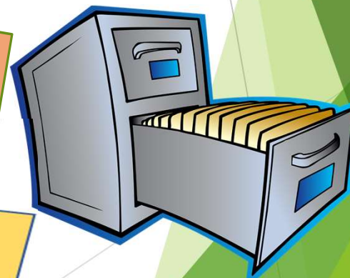
Other Health Records