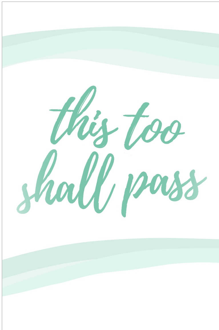
4x6 ART PRINT