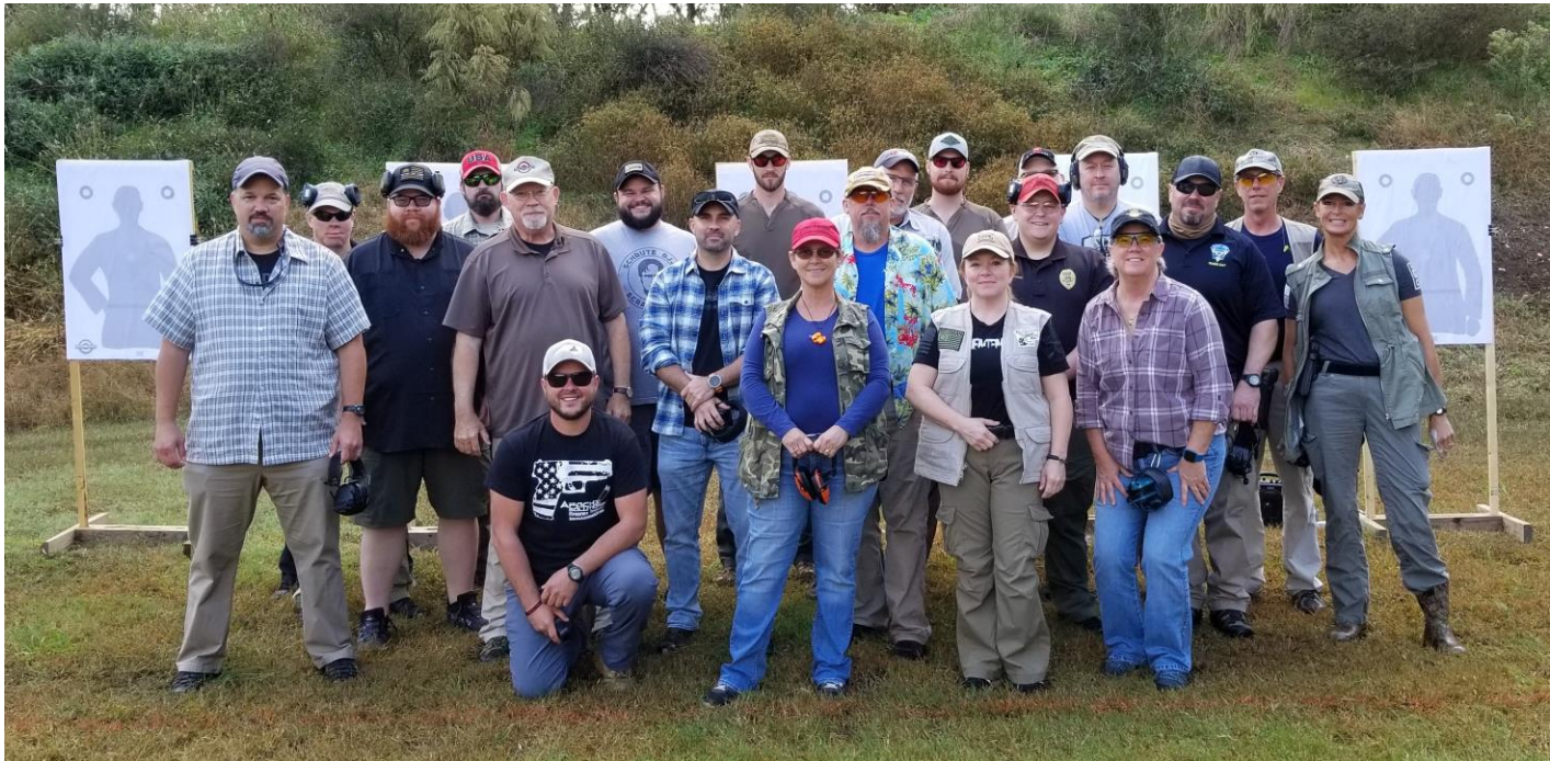
Firearms Instructor Development Course, Martin, GA, Oct 2020