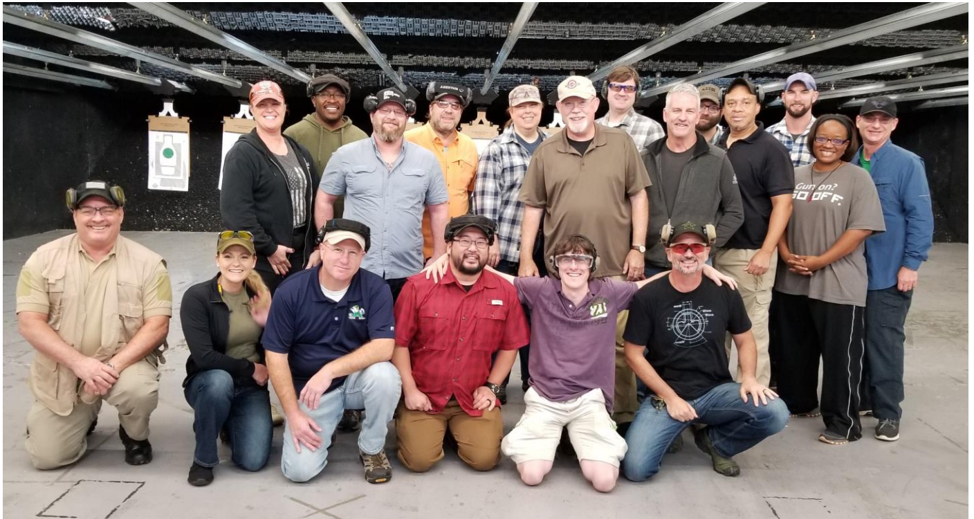
Firearms Instructor Development Course, Nashville, TN, Oct 2020