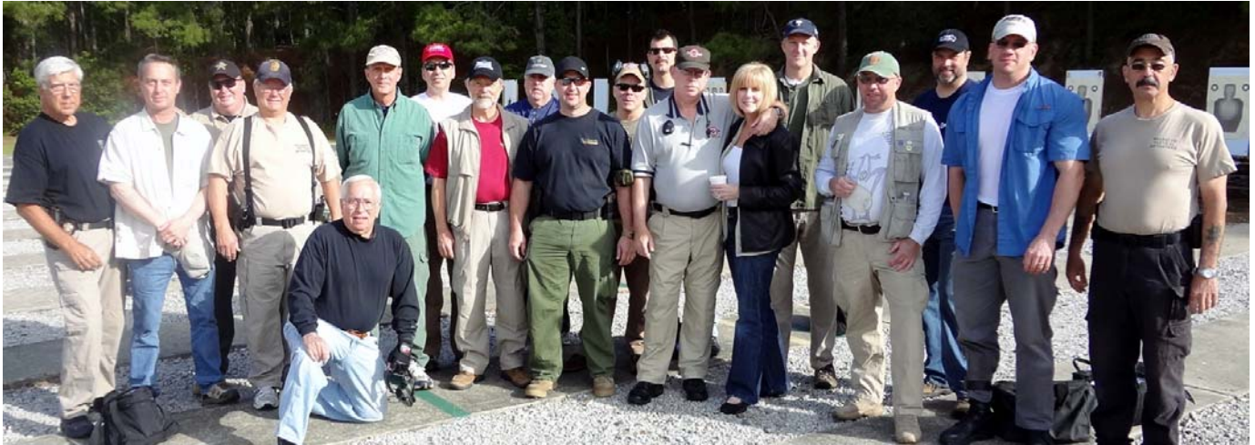
Class pic from Combative Pistol in Florence, South Carolina in 2011. We'll be back there in March, 2012